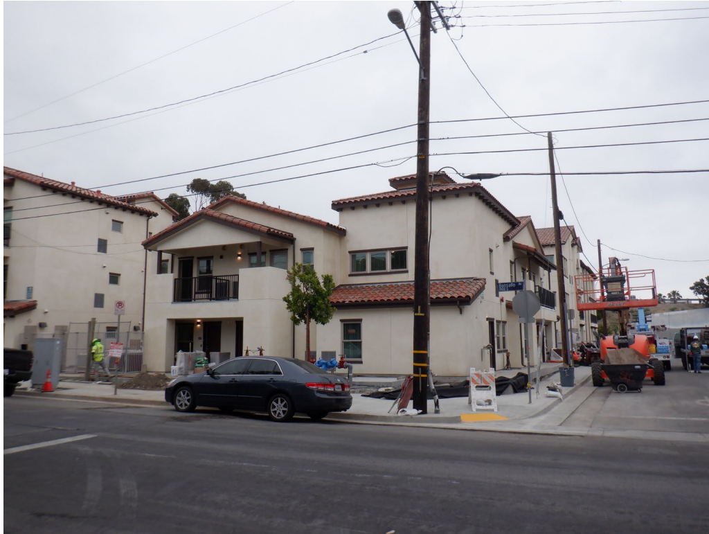
View from Bonsallo Street and 720 W. Washington Blvd.