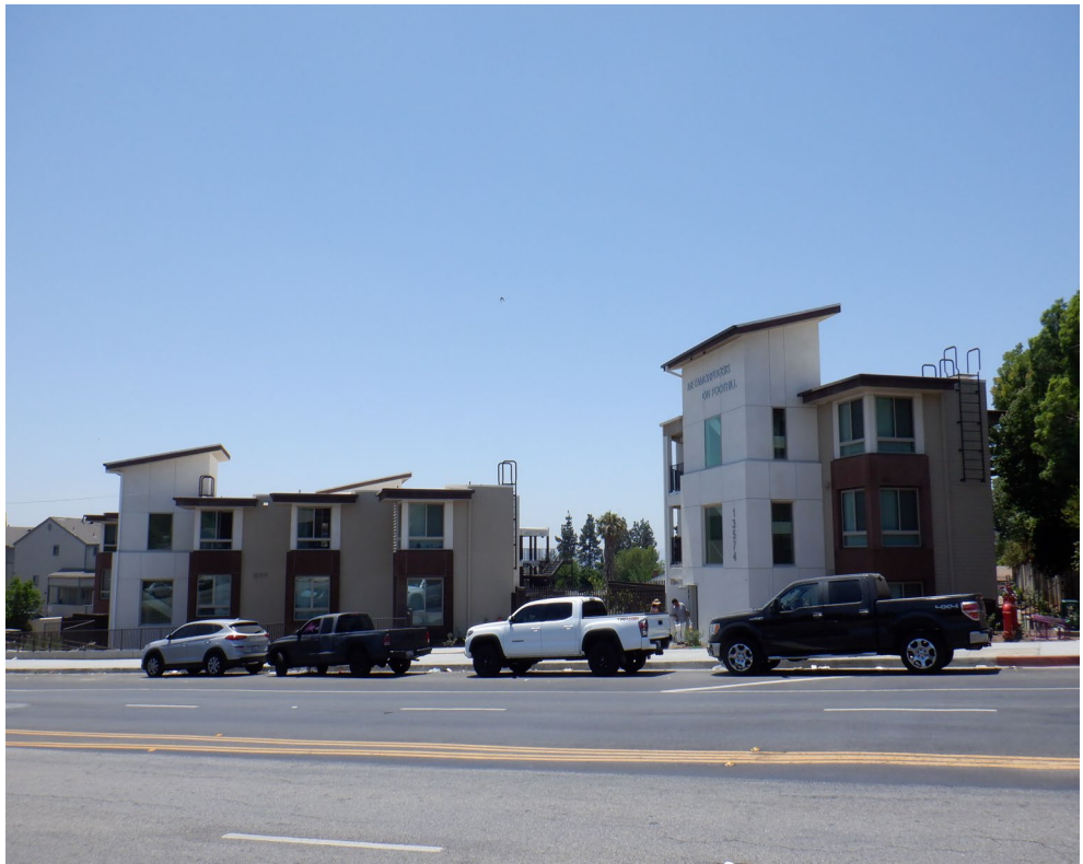
View of the buildings from the front of the site at 13574 Foothill Blvd.