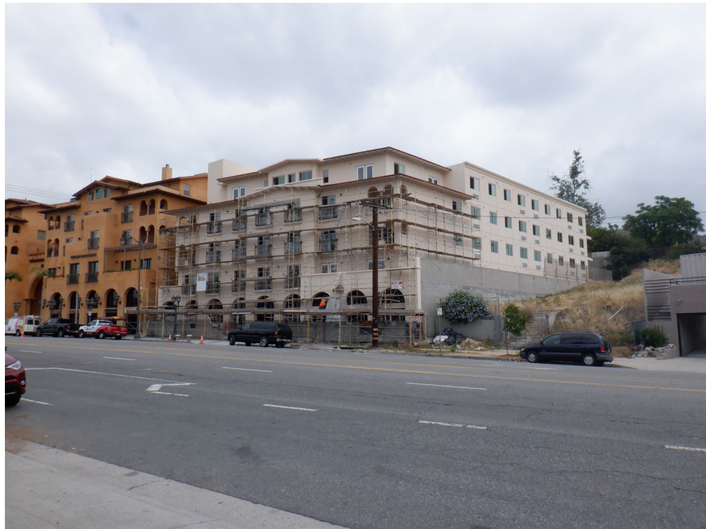
View from across the street.