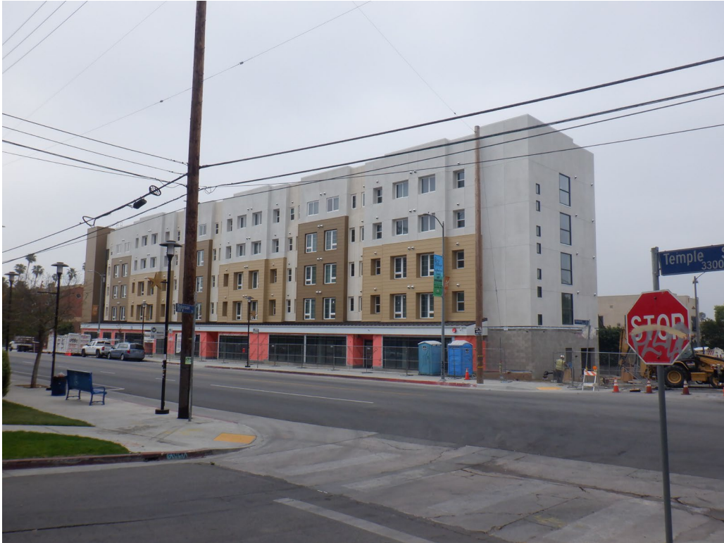
View from across the street at Temple & Robinson.