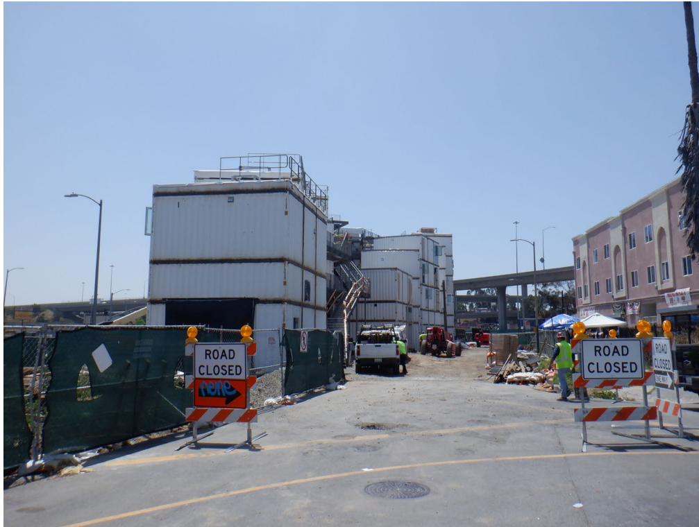
View from across the street Broadway & Athens St.