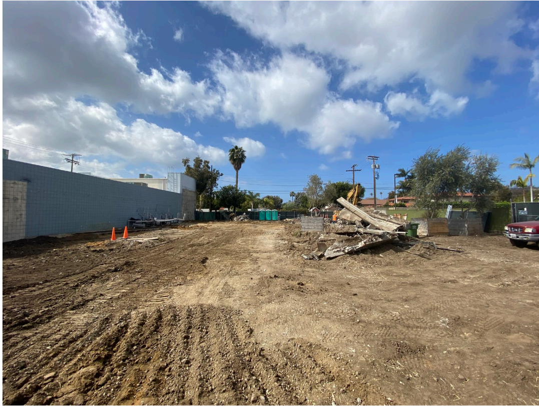
Picture of inside the site.