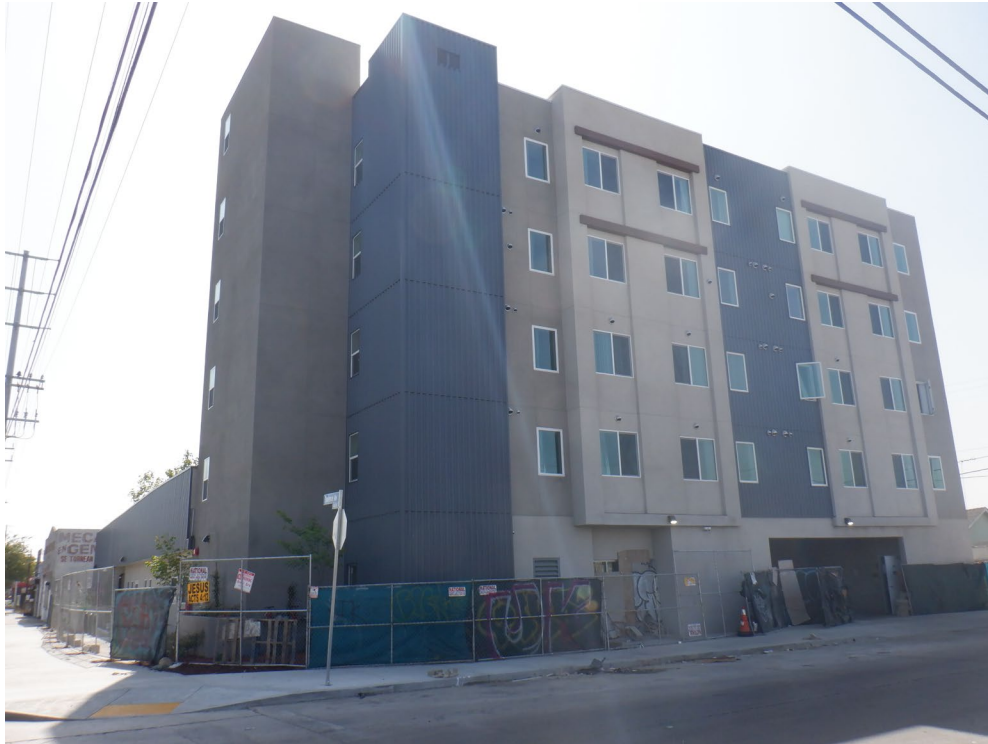
View from across the street at Florence Ave & Towne St.