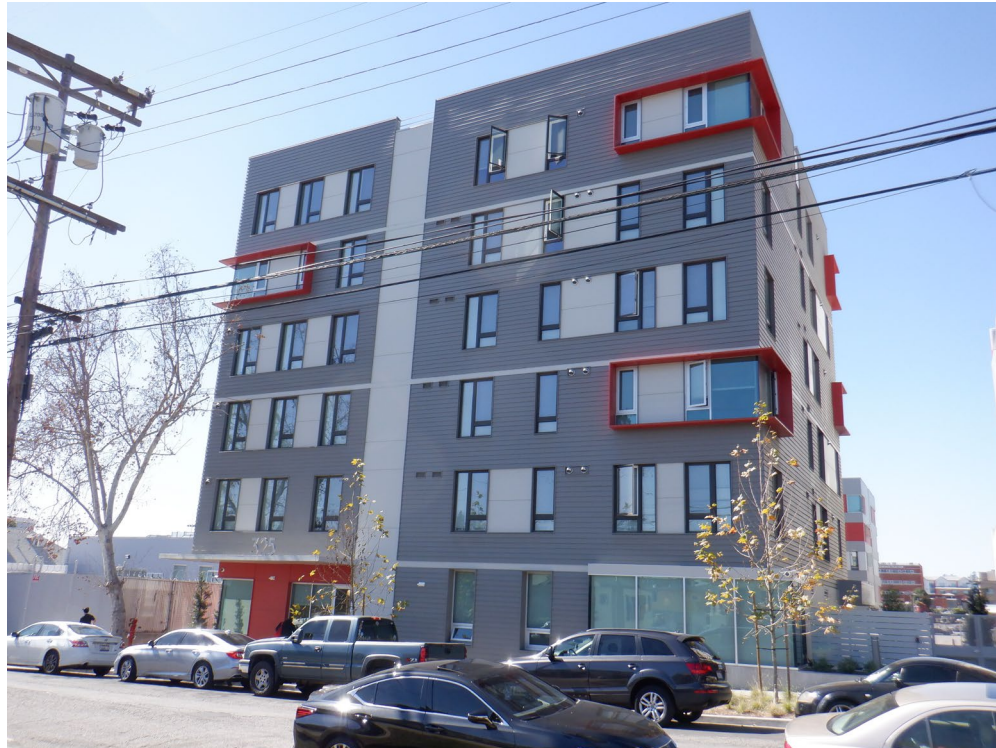
View of the site from across the street