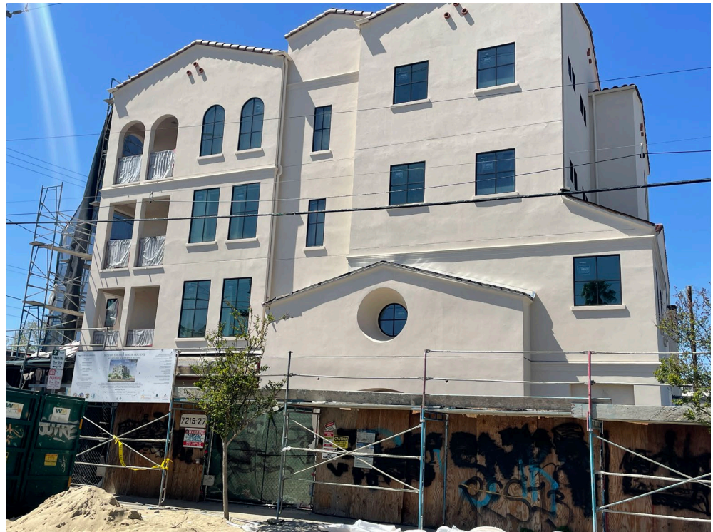
View from across the street at 7227 N. Canby St.