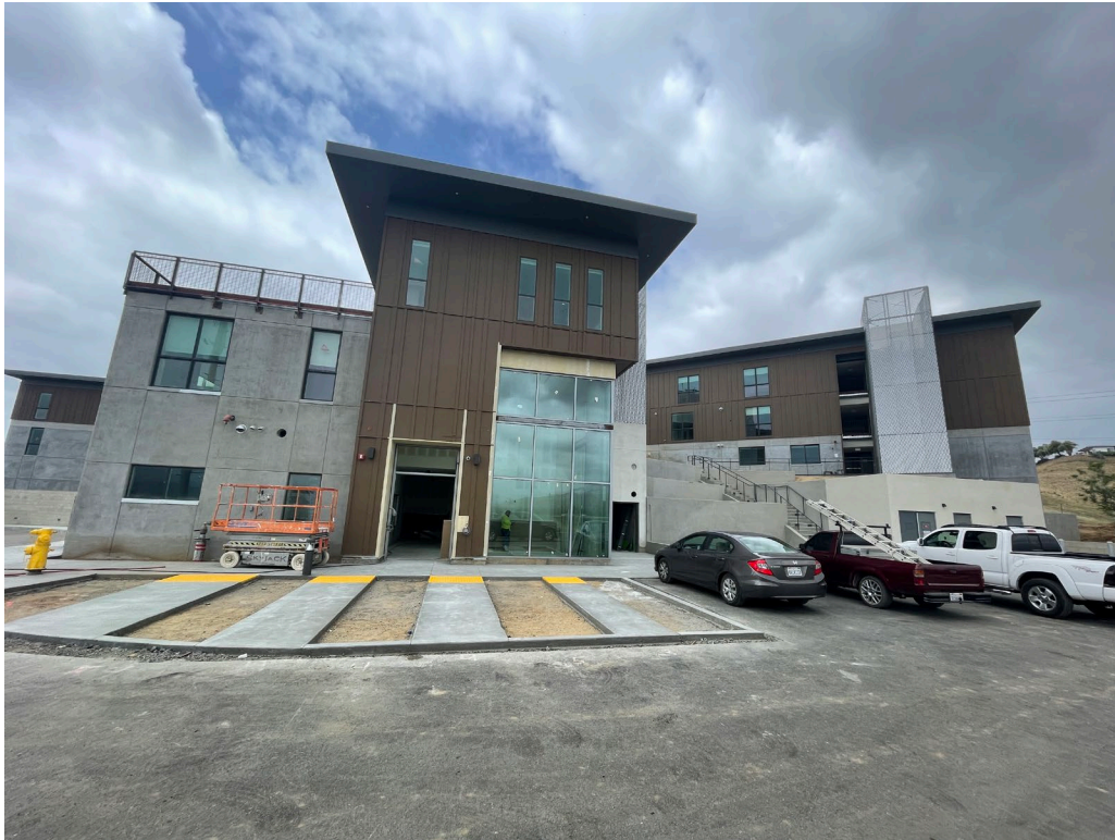
View from Parking lot.