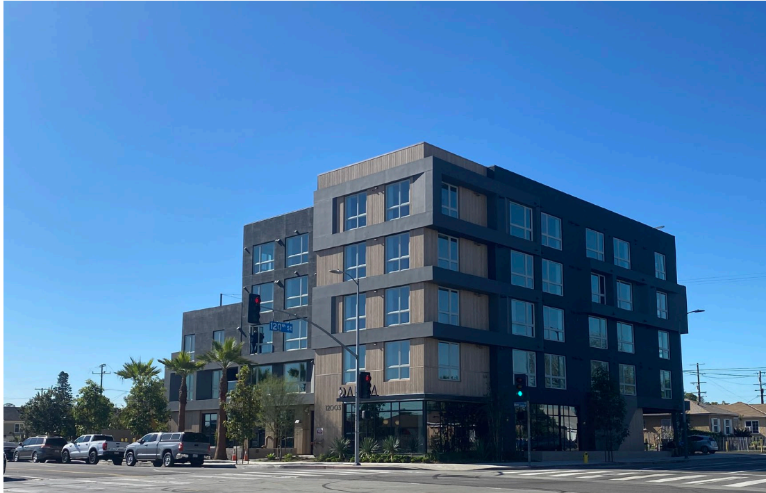
View from across the street at 12003 S. Main St.