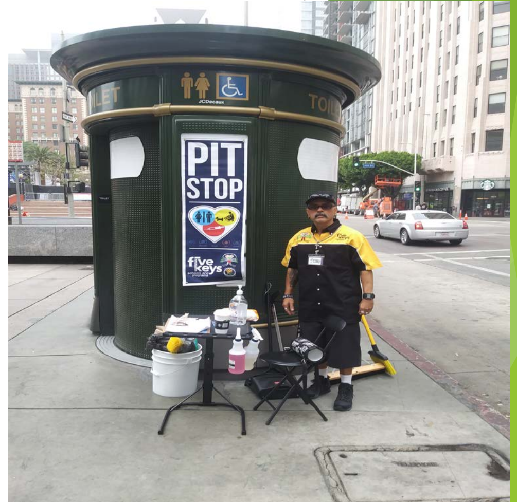
5 th and Hill St.