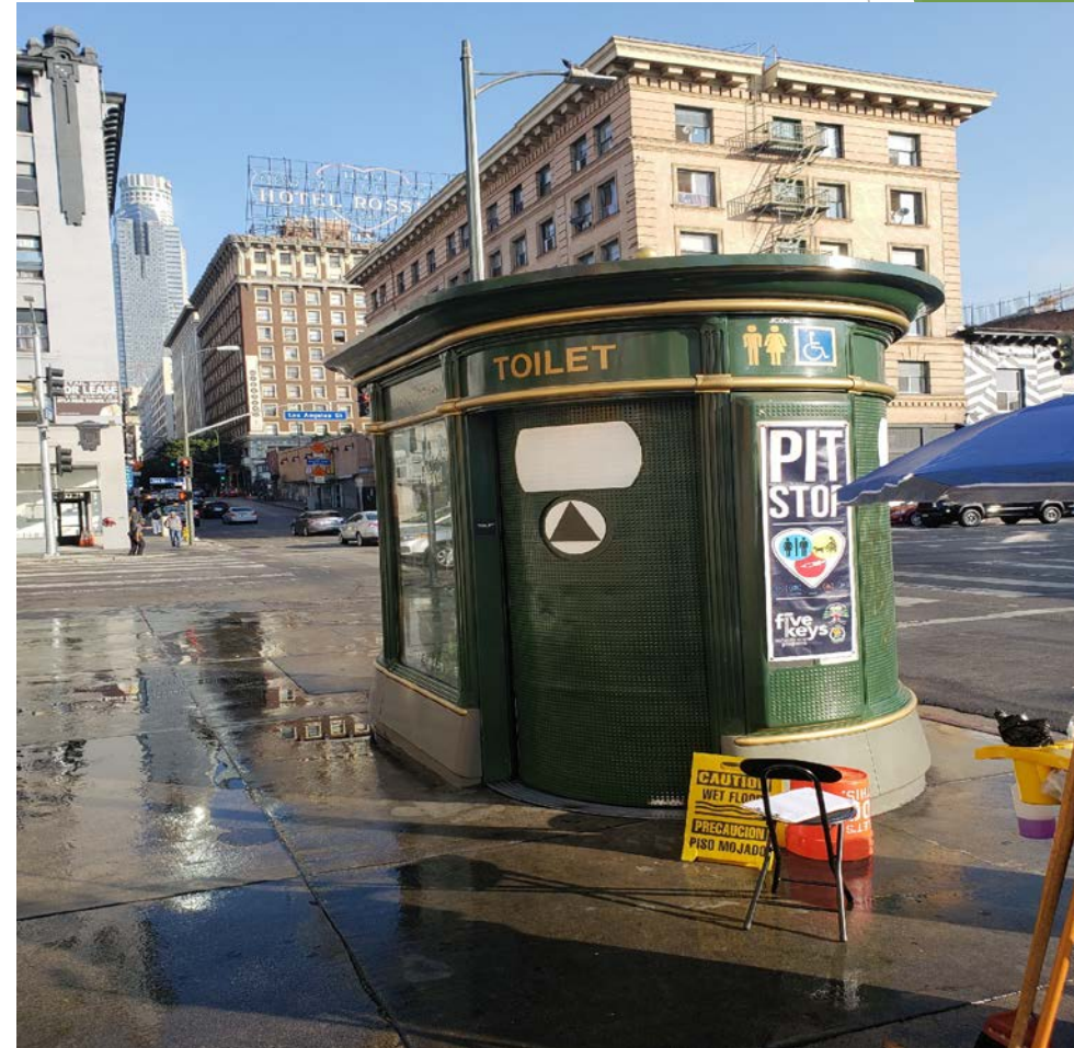
5 th and Los Angeles Ave.