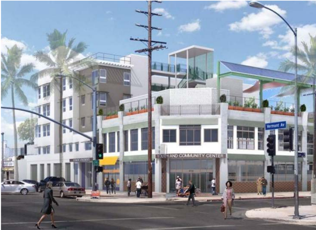
Community Build & WORKS