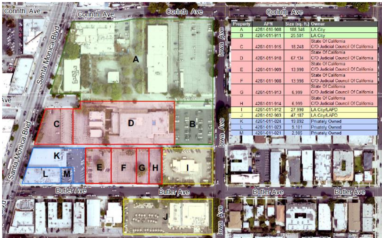
Figure 1 – Aerial Map of West Los Angeles Civic Center Campus

The County intends to select a developer, establish a project description, and complete the studies and outreach required under the CEQA prior to the February 2022 deadline. The County assumes that a completed CEQA process will be required by the developer in order for the developer to commit the funds to purchase the site by the deadline.