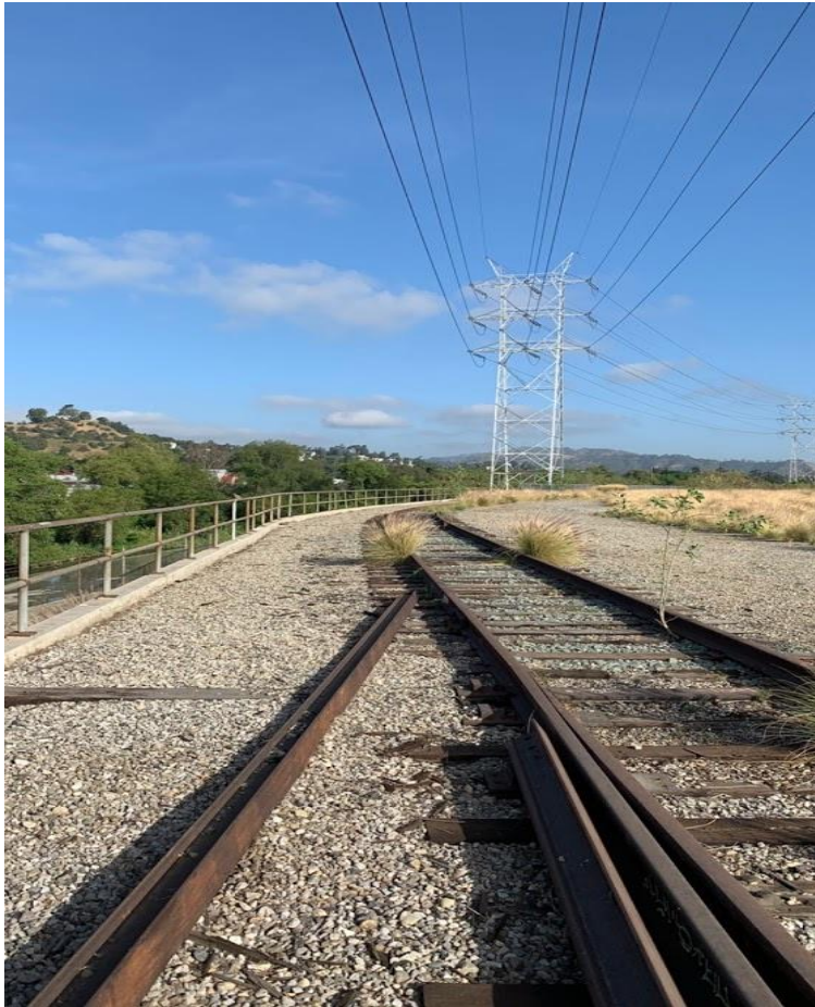
Existing Power Lines at the western edge of G2 Parcel