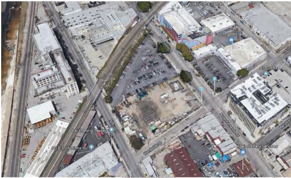
Figure 1 Aerial View of Project Site Location