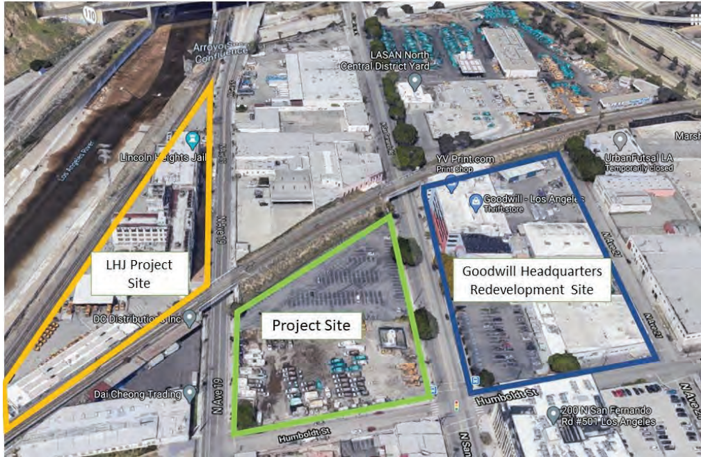
Figure 3 From left to right LA River, Lincoln Heights Jail, Project Site, Goodwill Headquarters (342 N. San Fernando Road)