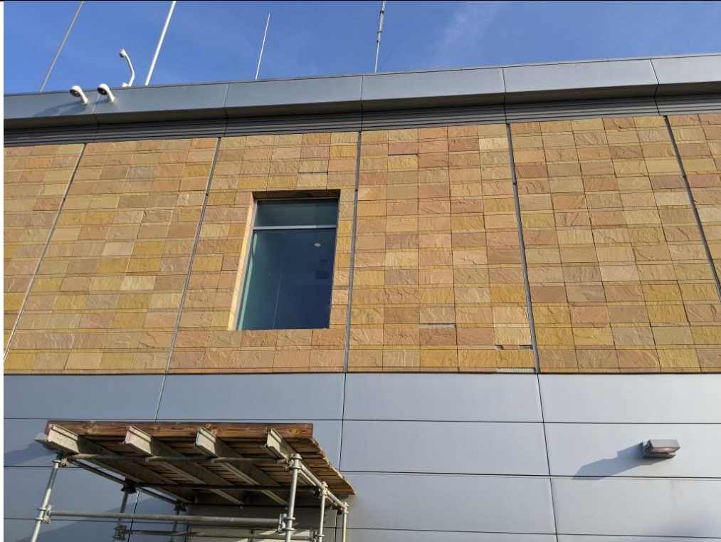
Erected scaffolding over entrance on South Side. Visible tiles fallen from façade