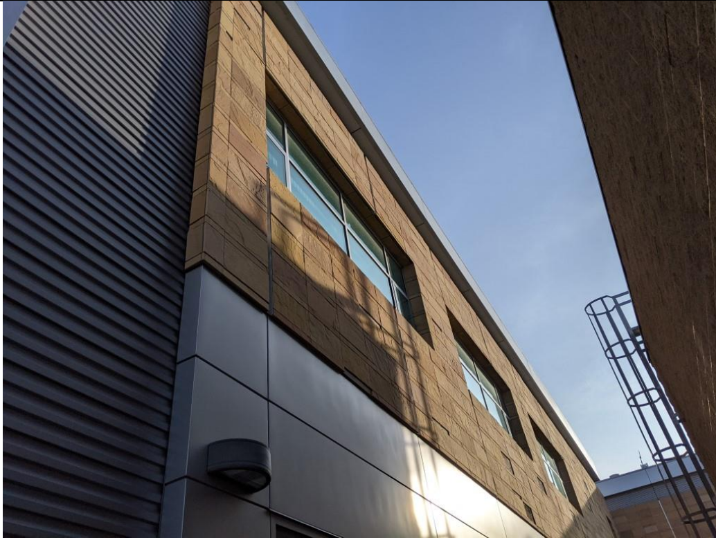
South-facing side of EOC facility