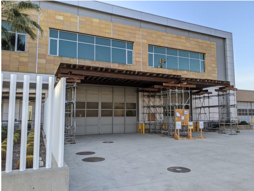
North side of facility. Erected scaffolding over FS4 firetruck entrances